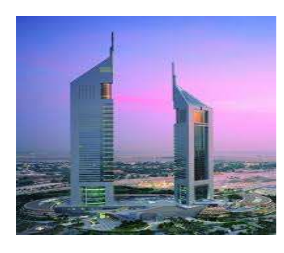
Project: Emirates Towers-Dubai MEP Contractor: ETA MNE – Dubai