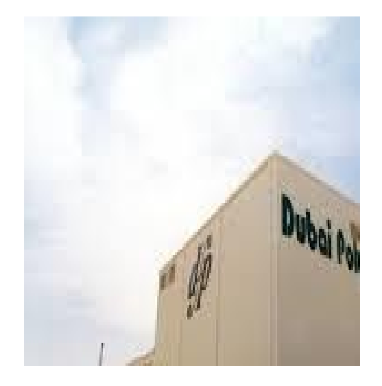
Project: Dubai Poly Filim-Dubai