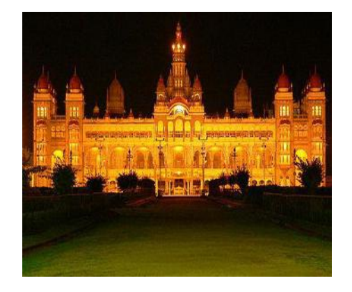
Project: Al Rawdha Palace –Al Ain Consultant: WS Atkins Main Contractor: BESIX & Arabtech MEP Contractor: Omega Engineering