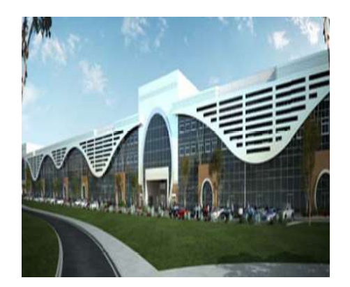
Project: Barwa Commercial Avenue-Ph-I & II Consultant : AECOM Middle East MEPContractor : ETA M&E

Project:Al Ain Mall– Al Ain Consultant: Khatib & Alami Main Contractor: Al Farah Group MEP Contractor: Al Sabah Electro Mech.