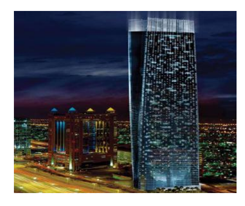
Project: Sama Tower – Dubai Consultant: WS Atkins & Partners MEP Contractor:ETA MNE – Dubai

Project:Jumeirah Beach Res. Consultant: WS Atkins & Partners Main Contractor: Al Ahmadiah Contracting. MEP Contractor: ETA MNE – Dubai