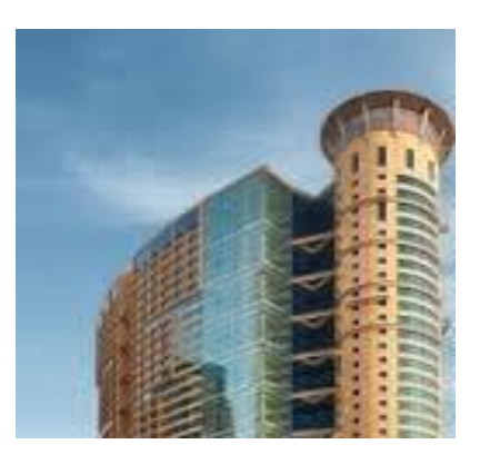
Project: Al Wahda City -Abudhabi MEP Contractor: THERMO