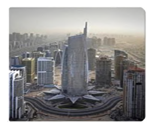
Project: Al Mas Tower– Dubai Consultant: WS Atkins & Partners Main Contractor:Arabian Construction Company MEP Contractor: ETA MNE – Dubai