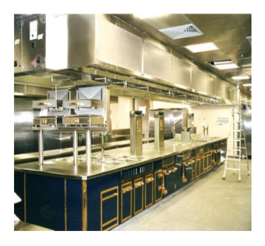
Project: Zabeel Kitchen -Dubai