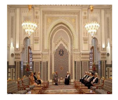
Project: HRH Pr. Sultan Palace - Riyadh