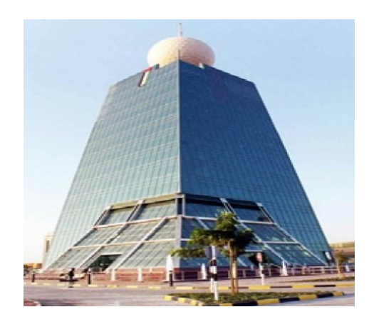
Project: Etisalat Telecom – Ajman MEP Contractor: Energo Project