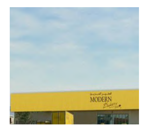
Project: Modern Bakery - Dubai MEP Contractor : IEMSC