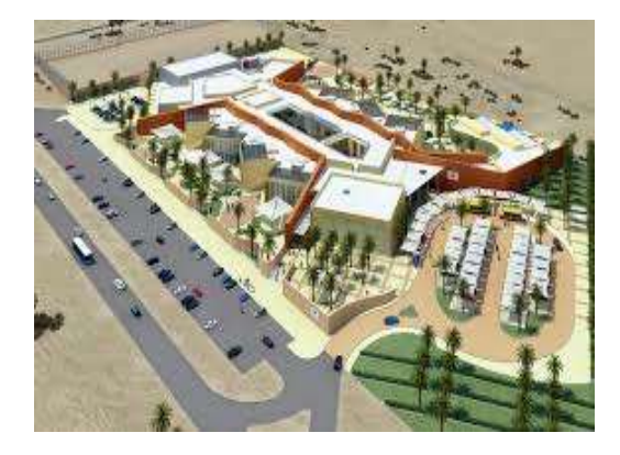
Project:Abudhabi Future School –Al Ain Consultant: KEO International MEP Contractor: AL FARA'A Engineering