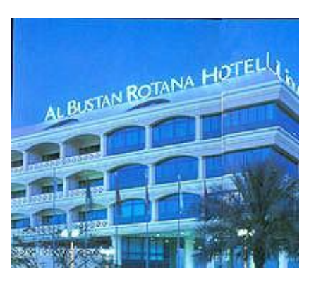
Project: Al Bustan Rotana Hotel-Dubai MEP Contractor: ETA MNE