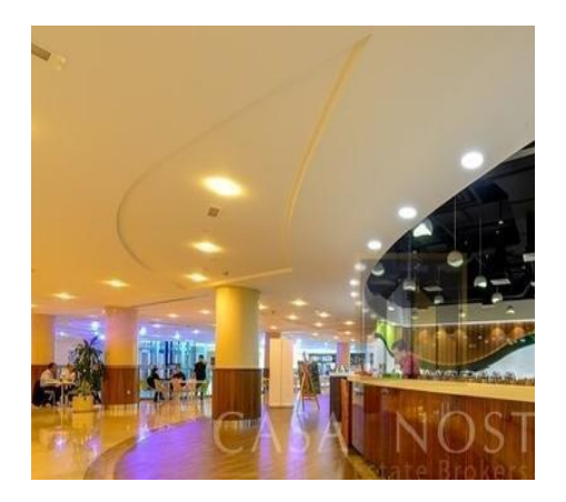
Project: DAFZA Food Court -Dubai MAIN Contractor: ASCON MEP Contractor: IEMSC