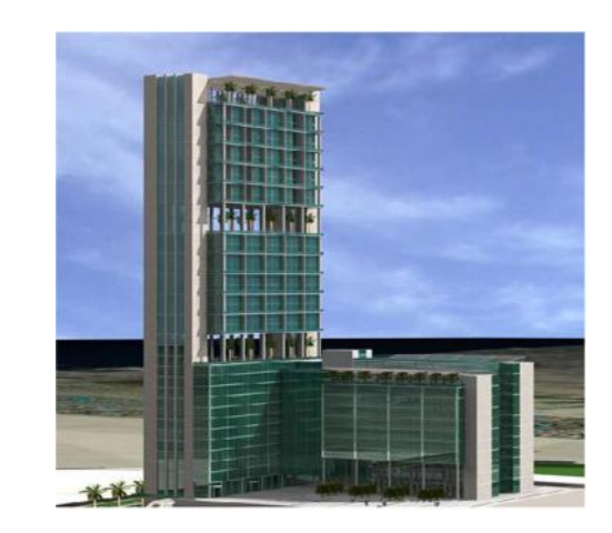
Project: Liberty House-Dubai MEP Contractor: ETA MNE – Dubai