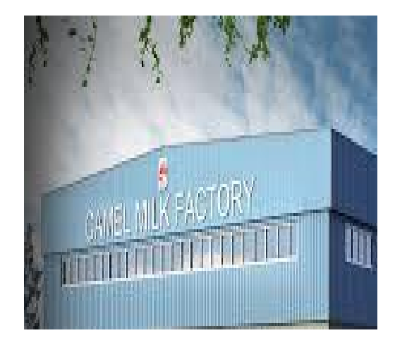
Project: Camel Milk Factory-Al Ain MEP Contractor:Jasaf Building Contracting