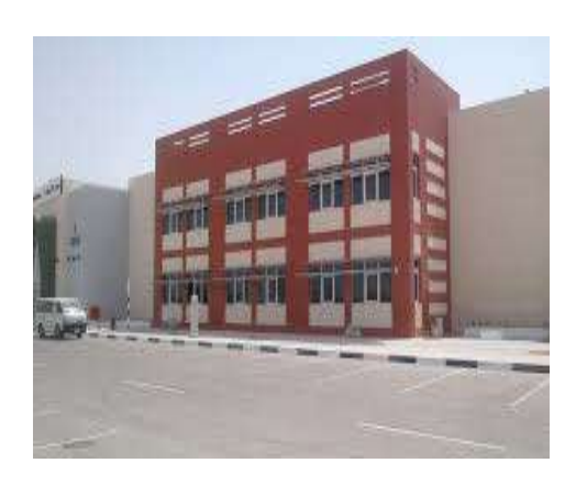
Project: Abudhabi Future School –Baniyas Consultant:Dewan Consultant Main Contractor: AMANA Contracting MEP Controctor: ETA MNE – Abudhabi