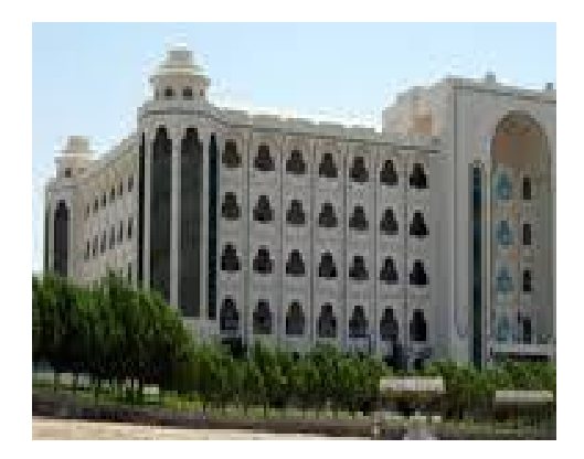
Project: Ghantoot Palace-Abudhabi MEP Contractor: ETA M&E

Project: Ruwais Palace–Ruwais Consultant: Arch Group Main Contractor: ASCON MEP Contractor: ETA M&E-Abudhabi