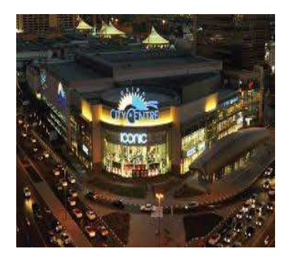
Project: Deira city centre -Dubai MEP Contractor:ETA MNE –Dubai