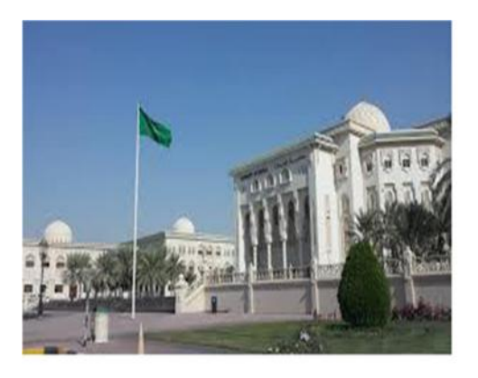
Project: Etisalat College Of Engineering -SHJ MEP Contractor: GECO Mech & Electrical.