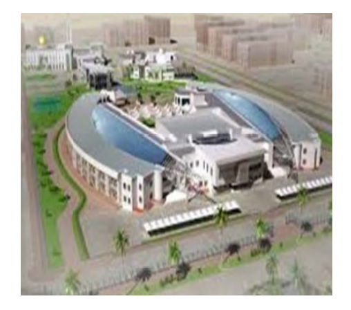
Project : Barwa City Consultant: AECOM MEP Contractor: ETA MNE