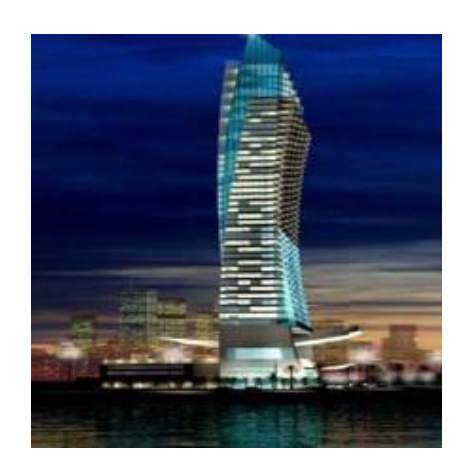
Project : Jawaharah Tower Jeddah