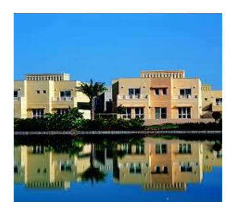
Project: Medous Villas- Dubai MEP Contractor: ETA MNE -DUBAI