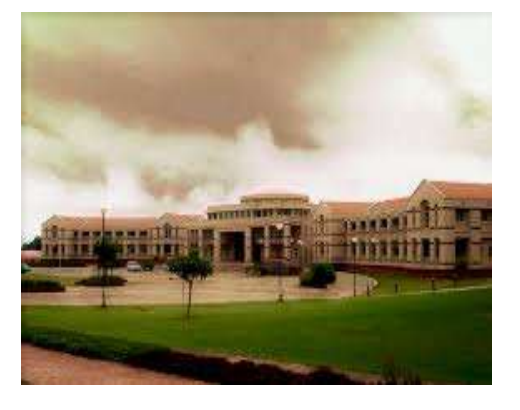
Projec: Bits Pilani College -Aweer Main Contractor: ASCON MEP Contractor: Dubai Masters