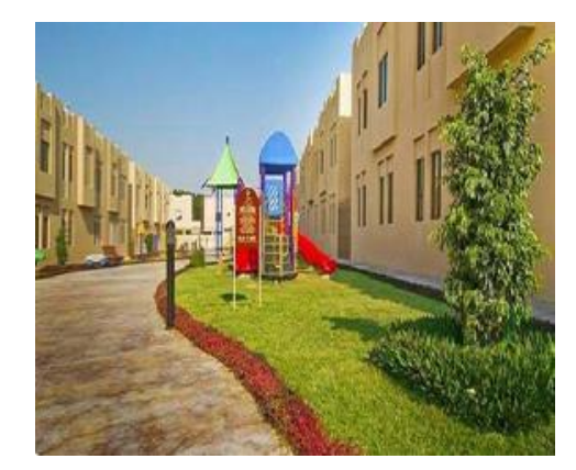
Project: 148 Villa - Qatar Consultant: South West Architecture MEP Contractor: ETA M&E