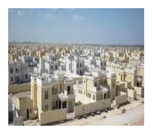
Project: Al Falah Villas - Abudhabi Consultant: Khatib & Alami MEP Contractor: ALEC/EL Mech.JV