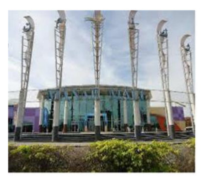
Project: Manar Mall-RAK Consultant: Manar Development Main Contractor: Manar Development MEP Contractor: ETA MNE - DUBAI